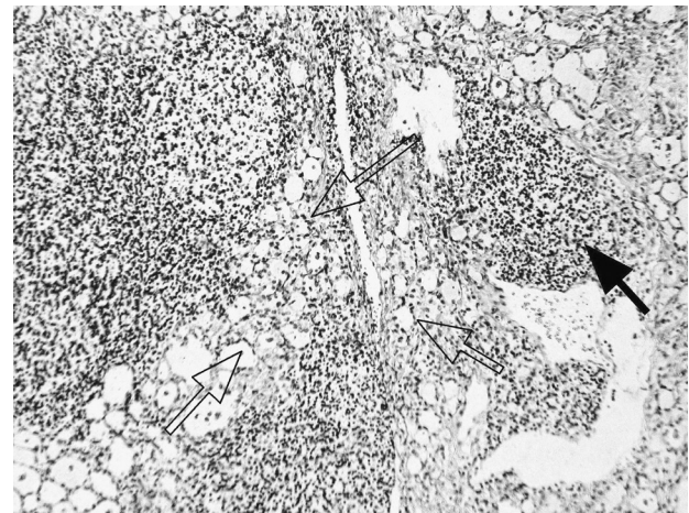
Figure 2. EBV in lymphocytic infiltration in Hashimoto's thyroiditis. In situ hybridisation reaction with virus-encoded small nuclear non-polyadenylated RNAs (EBER) showed EBV presence in the nuclei of infiltrating lymphocytes (arrow) and in nuclei of follicular cells (open arrow). EBER, 150×

Rycina 1. Ekspesja LMP1 w zapaleniu tarczycy Hashimoto. Reakcja immunohistochemiczna z cytoplazmatycznym latentnym białkiem błonowym 1 (LMP1) uwiidocznila obecność EBV w komórkach pęcherzykowych (pusta strzałka) i w naciekających limfocytach (strzałka). Awidyna–biotyna–peroksydaza, diaminobenzydyna, 400×